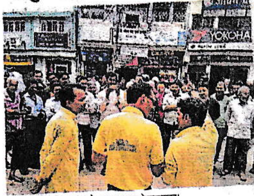
नुककड़ नाटक के माध्यम से जागरूक करते कलाकार।