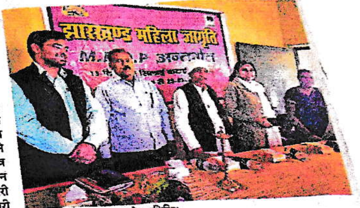
ट्रेनिंग की शुरूआत करते अतिथि।